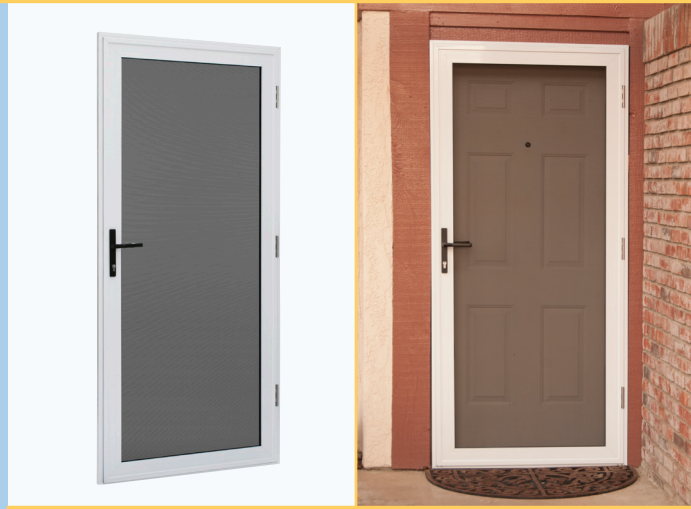
VISTA SECURITY SCREEN® HINGED SECURITY DOORS

Vista Security Screen™ Hinged Doors are often the first line of defense to protect you and your property. Vista Security Screen™ Hinged Doors are available to accommodate a wide range of swinging door applications, either in an interior or exterior mount configuration. All Vista Security Screen™ Doors are manufactured with 316 marine grade black powder coated stainless steel mesh. Vista Security Screen™ Doors are architecturally designed to easily incorporate into aluminum, vinyl, or wood framed openings, for both new and existing structures.