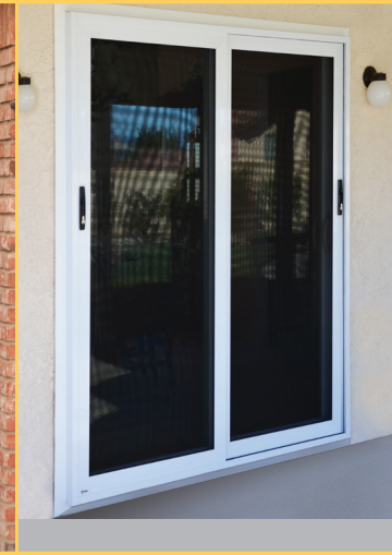
VISTA SECURITY SCREEN® DOUBLE/SINGLE SLIDING DOORS

Vista Security Screen™ Double/Single Sliding Patio Doors can protect either the single sliding glass door or both glass panels. Double Security Patio Doors protect the sliding glass door and the stationary glass door panel from intruders. Double and Single Security Doors have a three-point latching system with one simple locking action. Vista Security Screen™ Patio Doors filter out 60% of the sun's harmful U.V. rays. Both the Single and Double Security Doors are available in an aluminum frame surround system that reduces installation time.